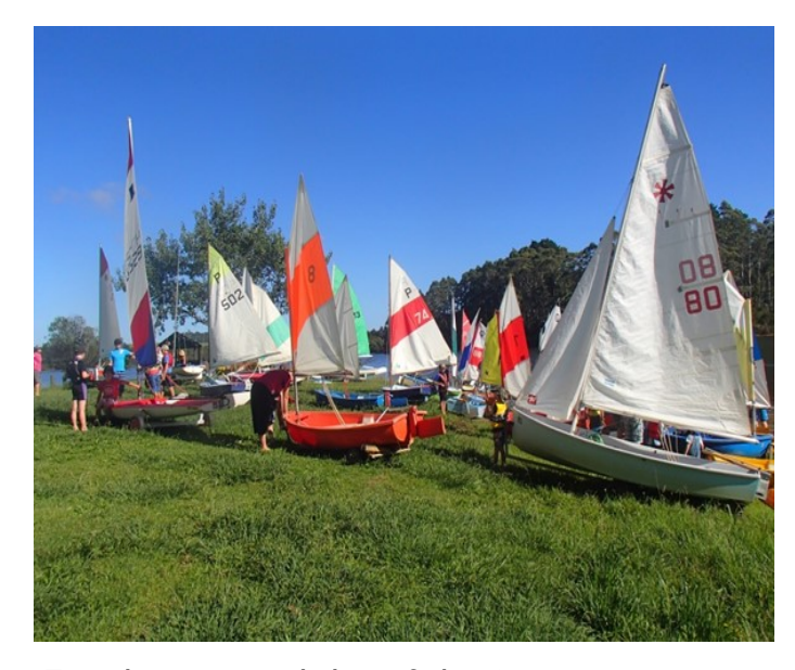
First learn to sail day of the Autumn session.

The Team sailors have continued to train in earnest (some also sailed in the Sunday regatta). We have 16 sailors coming up from Whangarei on the 12<sup>th</sup> and 13<sup>th</sup> of March to train with two Kerikeri teams for the two days.