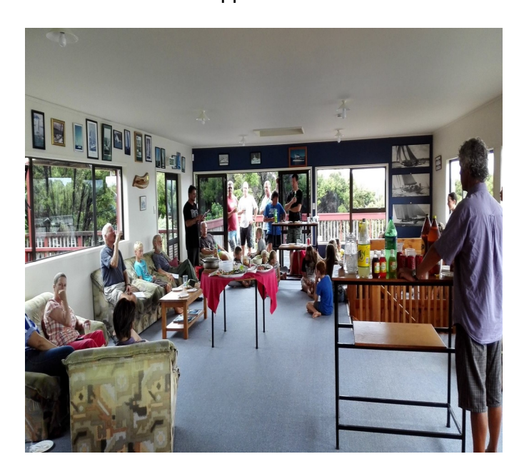
Continued page 3

The centreboard regatta and the ladies race participants, met in the clubhouse after their respective races on Sunday 28th Feb, and were treated to gourmet nibbles prepared by Charles and Daniel which was much appreciated.