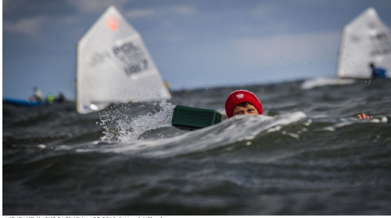
MIRABAUD YACHT RACING IMAGE 2015