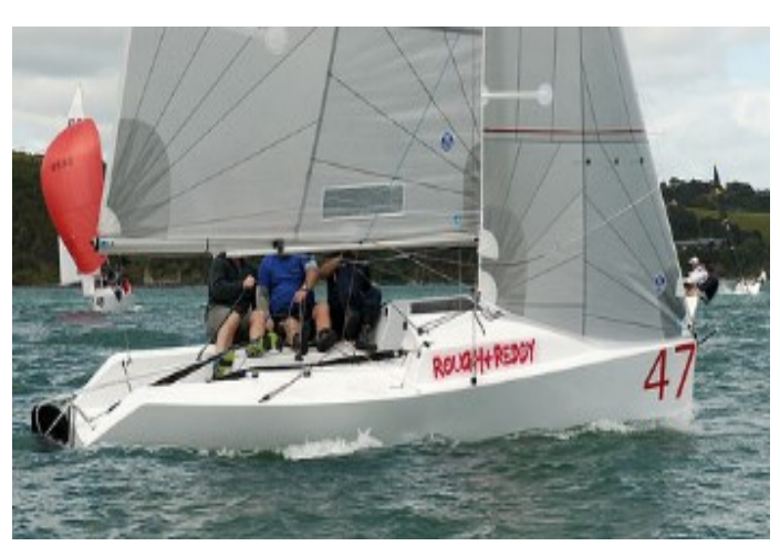
Elliots 5.9 Winner Rough and Ready and a shot of the fleet. See page 9 for results.